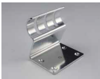
Metal surface mount clips (MT)