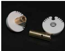
Copper end cap coupler accessory