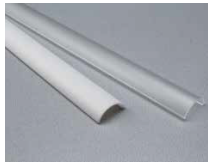
White lens (WH) Frost lens (FR)