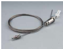
2M suspension cable (SP)