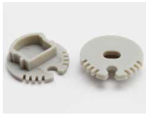
End cap with hole End cap without hole